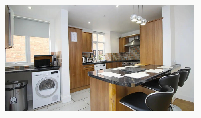
Kitchen and breakfast area