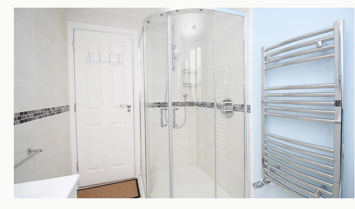
Shower and heated towel rail