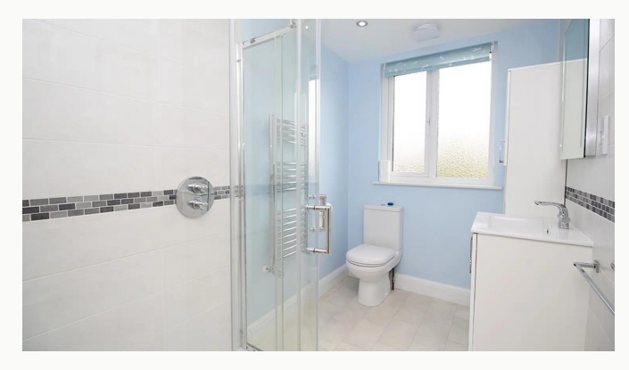
Shower Room (shared with one other room)