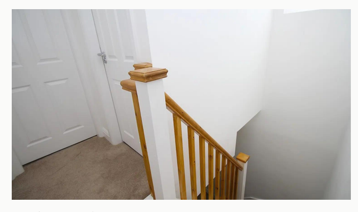
Top floor landing