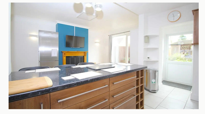
Breakfast area through to Living room