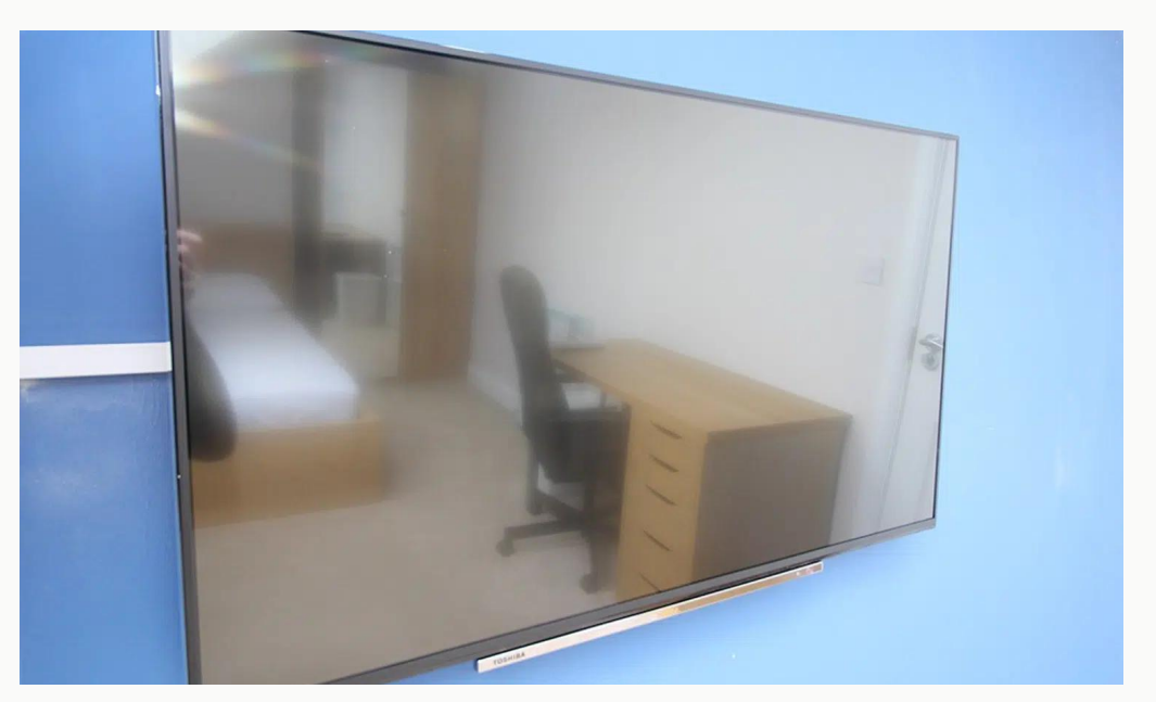
Wardrobe 42 inch 4K Toshiba TV