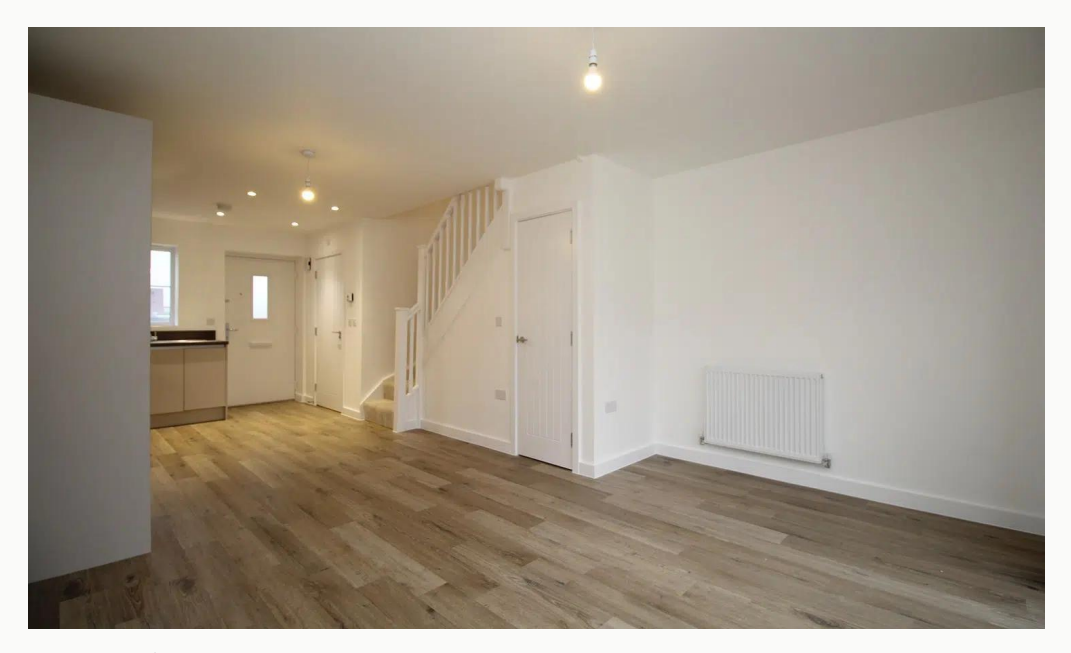
Lounge / Kitchen