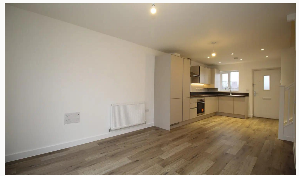
Lounge / Kitchen