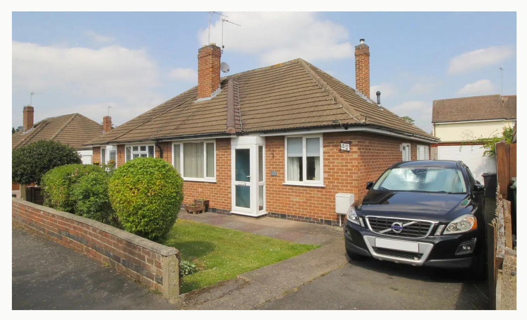
Driveway / Garage