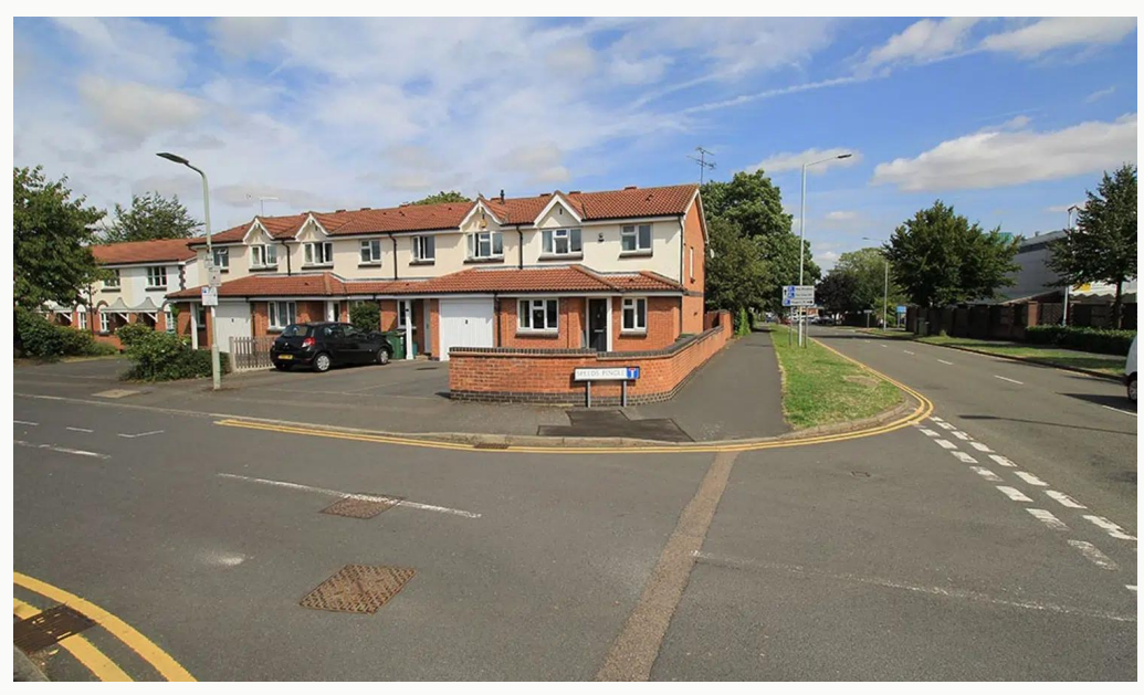
view from front View from street