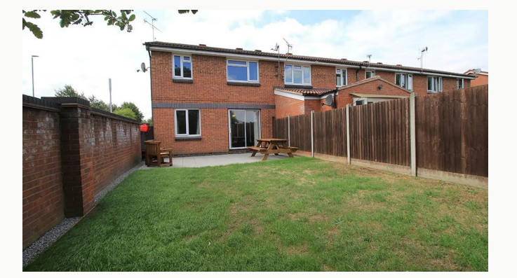
View of the back of the house