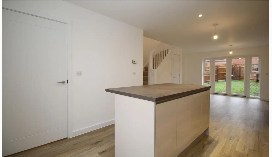
Lounge / Kitchen